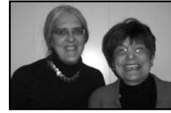
Stratum B, 9.0 Tables