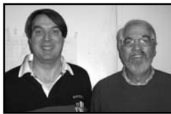
Stratum A, 7.0 Tables / Based on 22