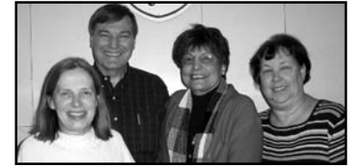
Stratum B, 7 Tables