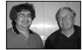
Stratum A, 9.0 Tables