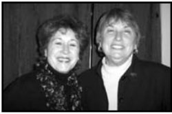
Stratum A, 7.5 Tables