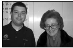
Stratum A, 14.0 Tables / Based on 34