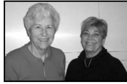
Stratum B, 10.0 Tables