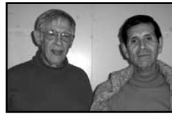
Stratum A, 5.0 Tables