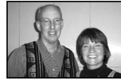
Stratum A, 11.0 Tables